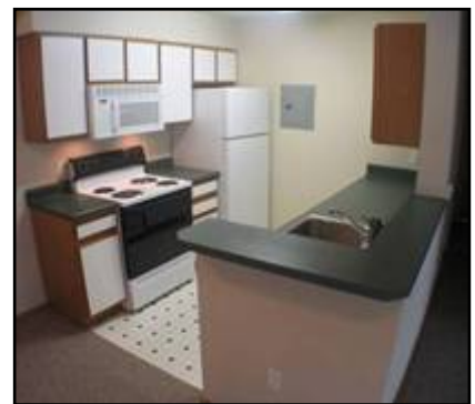
Wheelchair Accessible Option